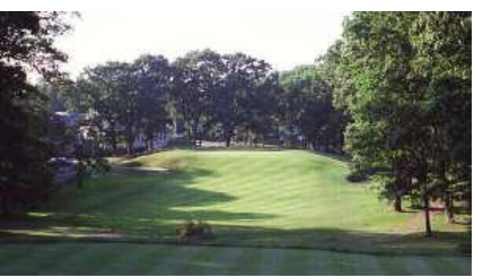
Pictured above: Charles River Country Club's 9th Hole

mist for months, from November to May. It's kind of deceiving. I know two years ago they didn't have rain from May 20 to September 20, something like that. You get fairly dry summers; in the summer it hardly ever rains there. But it's not as