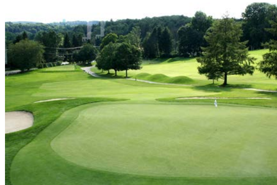
Marlborough's 18th hole