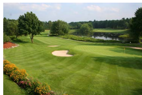
Walpole Country Club's 18th hole