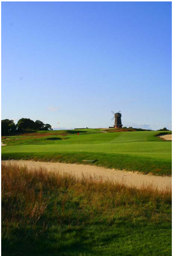
National Golf Links of America and the famous windmill off in the distance