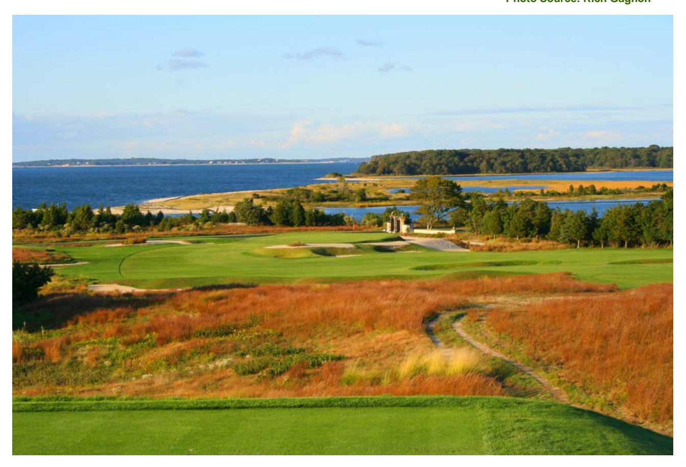
National Golf Links of America 17th hole