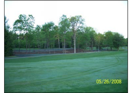
Renovations at Manchester CC: Photo to left - before renovations and Photo to Right - after renovations