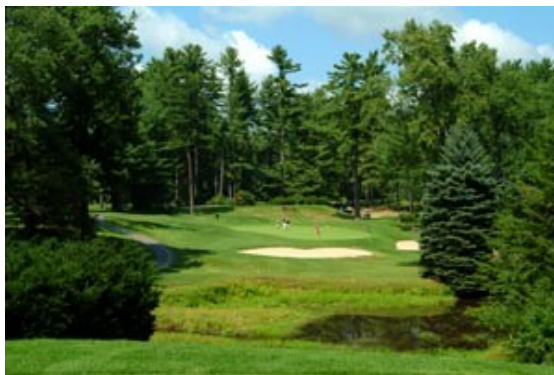
Manchester Country Club