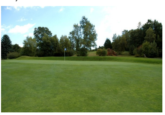
18th hole at Sandy Burr C.C.