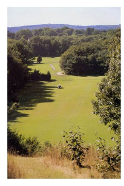
Sandy Burr C.C.