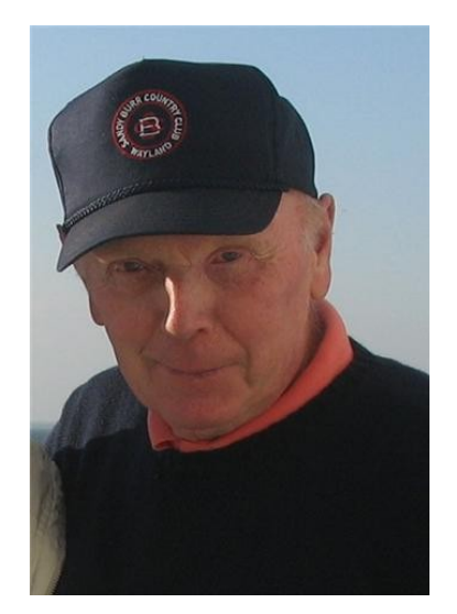
Charlie Zeh Photo Courtesy of The Zeh Family

from scratch. The greens were in poor condition and he returned them to where they should be. In the begin-