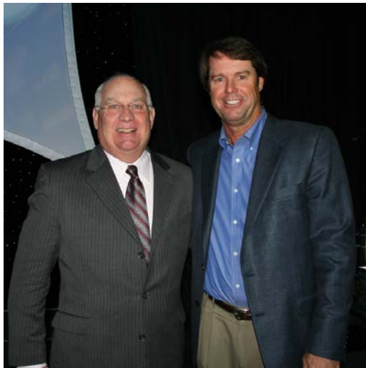
Jim Fitzroy, CGCS and 2008 Ryder Cup Captain Paul Azinger met during the Opening Session at the Golf Industry Show in New Orleans.

"It is an honor to be nominated (and later elected) for the position of vice president of GCSAA by my peers within the GCSA of New England, the