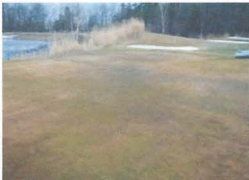
Picture: Pockets of turf with poor surface drainage, combined with extended ice cover and temperature fluctuations during the melt down, are extremely susceptible to injury.

By David Oatis, Director, Northeast Region Green Section