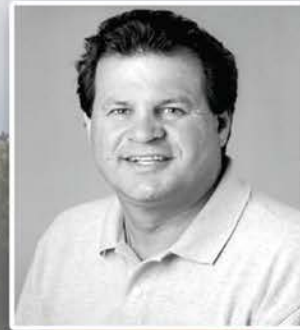
Keynote Speaker Tues., March 8 • 3:45pm Olympic Gold Medalist Mike Eruzione