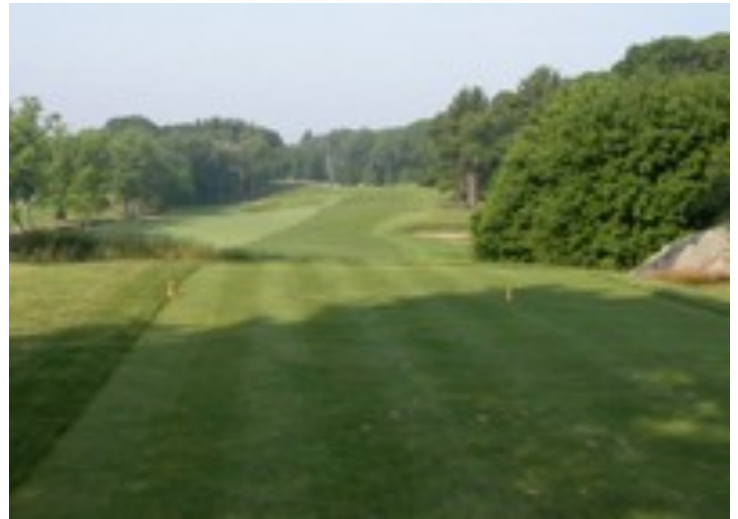
Cohasset Country Club

"It was a good night," he said. "It gave me a chance to show them what we're all about." ❖