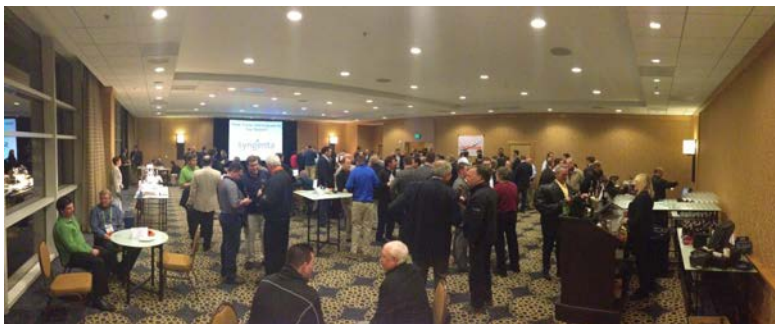
Nor'Easter Room 2013