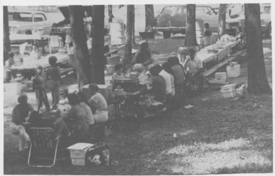
A cool spot out of the hot sun.