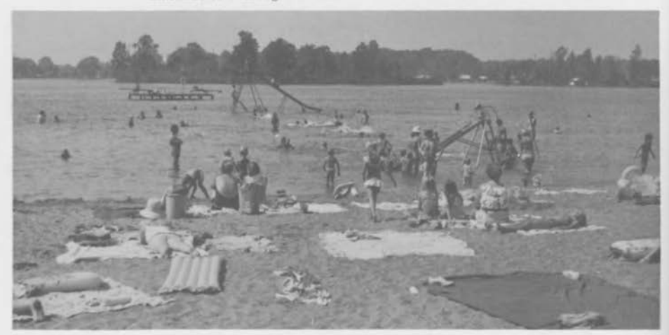
A place to enjoy one of summer's hottest days.