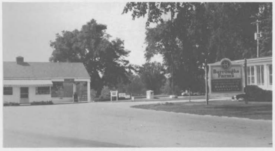
Entrance to Burroughs Farms - site of our Annual Picnic.