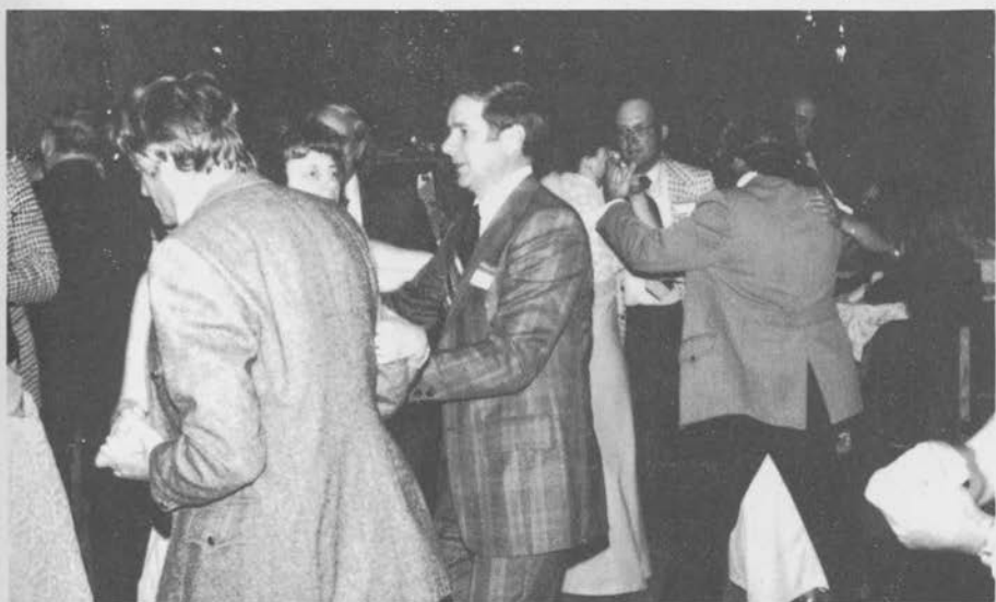
Some of the crowd of 150 enjoying the dance music at Edgewood CC.