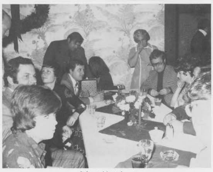
A fun table to be at