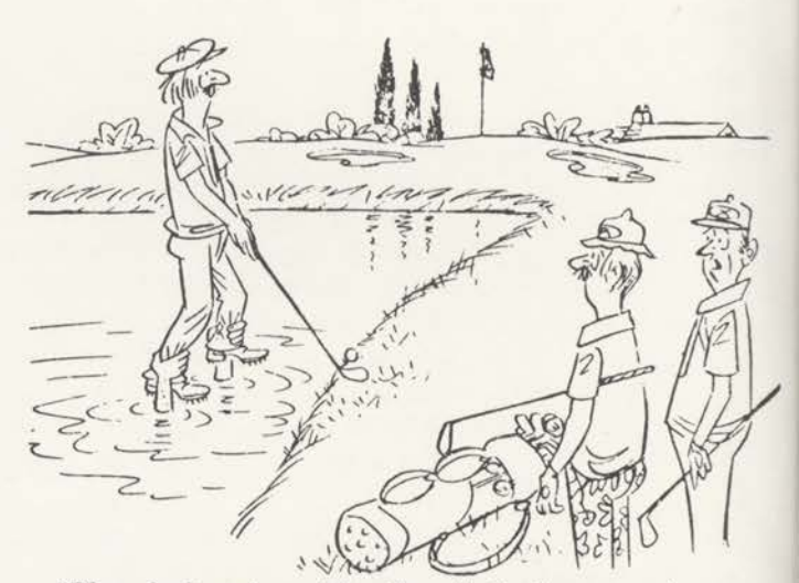
"They don't make caddies like old Cyril anymore."

Todd Polidor, Heritage Hills of Westchester