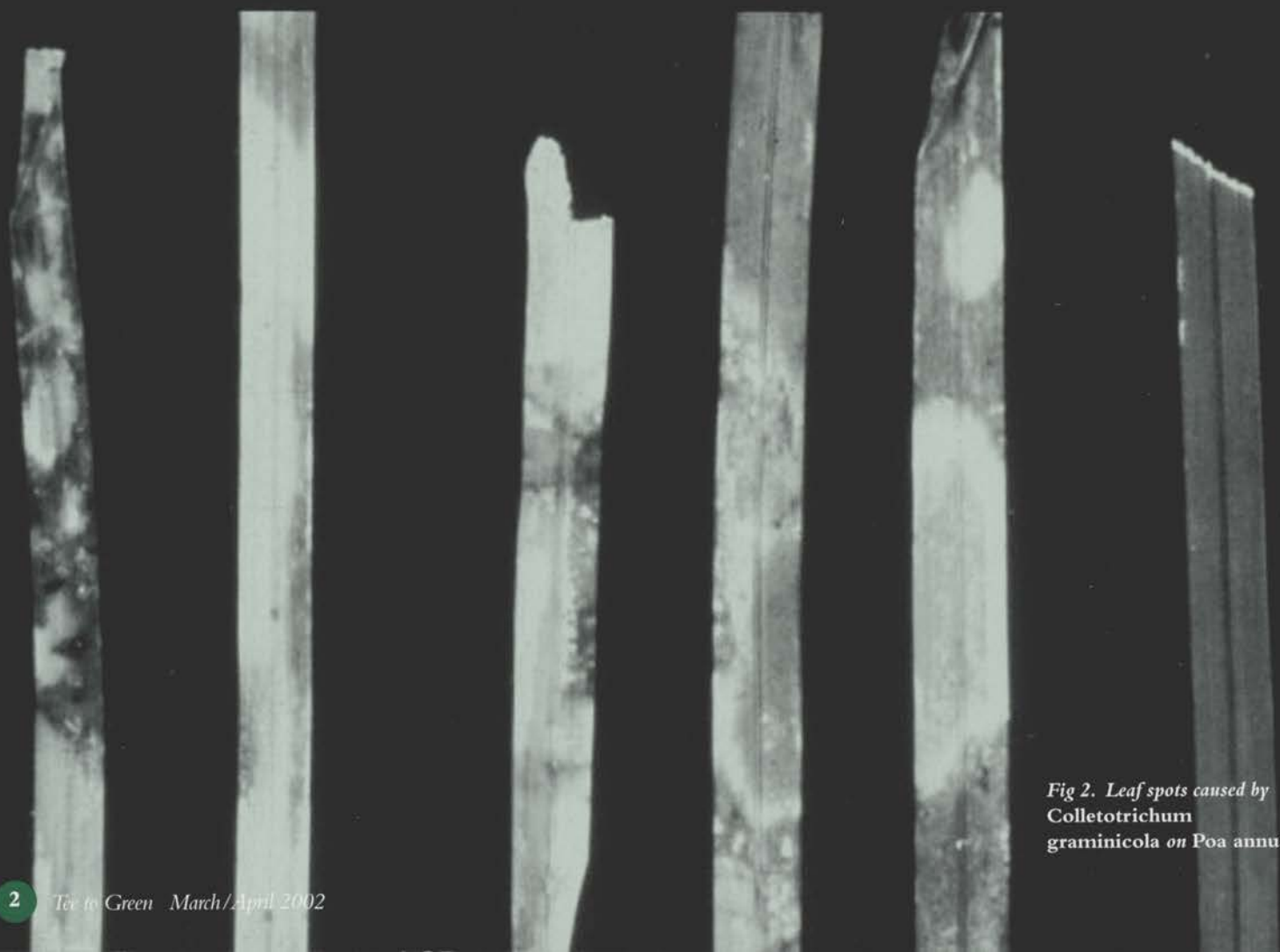
Fig 2. Leaf spots caused by Colletotrichum graminicola on Poa annua.