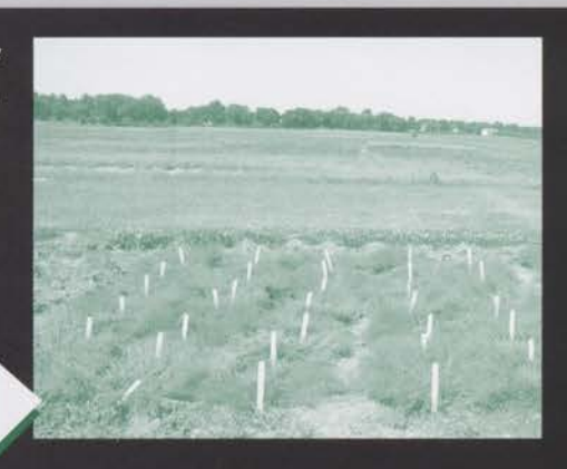
The clones with similar growth habit and agronomic traits are moved to isolated crossing blocks and interpollinated.

The first step in breeding for disease resistance is to collect germplasm and then evaluate it for resistance. Plant collections are inoculated with the dollar spot fungus. After the disease develops individual clones with improved resistance are selected.