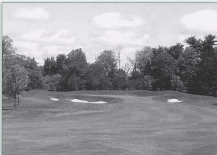
Cover: Westchester Country Club.