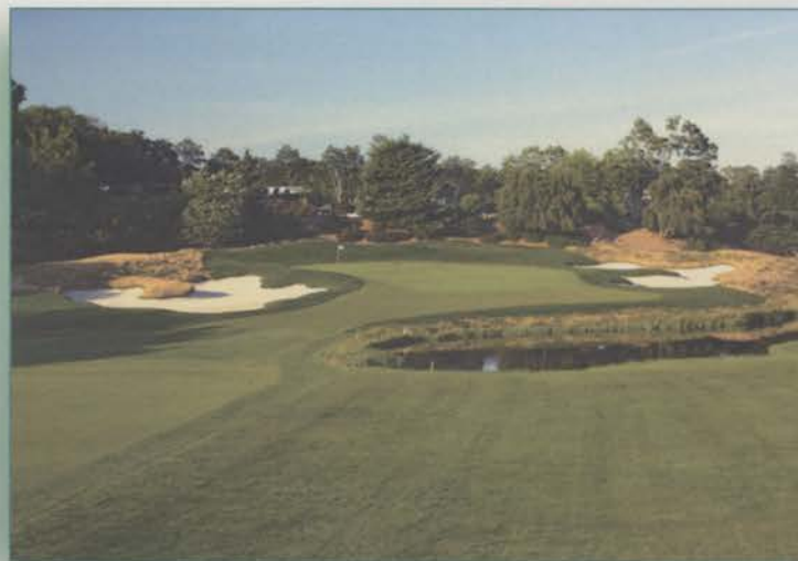
Redding Country Club