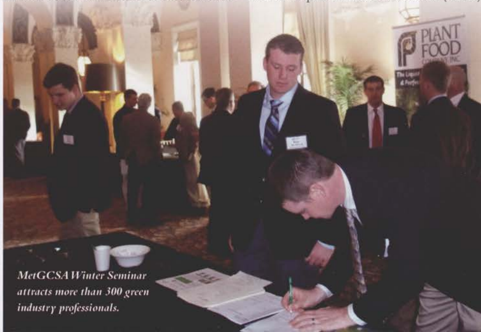
MetGCSA Winter Seminar attracts more than 300 green industry professionals.