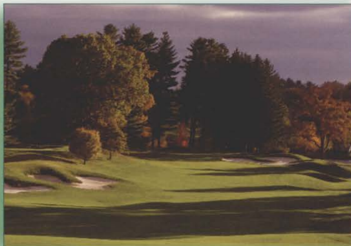
Cover: Glen Arbor Golf Club