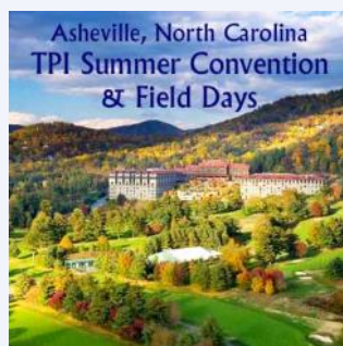
News about TPI's Summer Convention & Field Days In Asheville, North Carolina