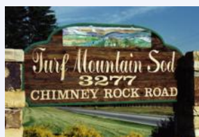
Interesting insight Turf Mountain Sod, host farm for TPI's upcoming Field Days