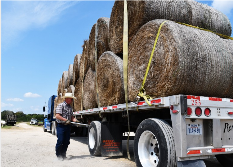
Diamond D Ranch Turf Farm in Nome, TX served as a staging area for livestock supplies during Hurricane Harvey.

NCSU Turfgrass Research Symposium Raleigh, NC 12/14