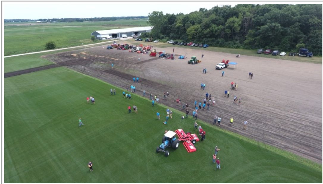
Bird's-eye view of Jasperson Sod Farm in Franksville, WI, site of the 2018 Wisconsin Sod Producers Field Day