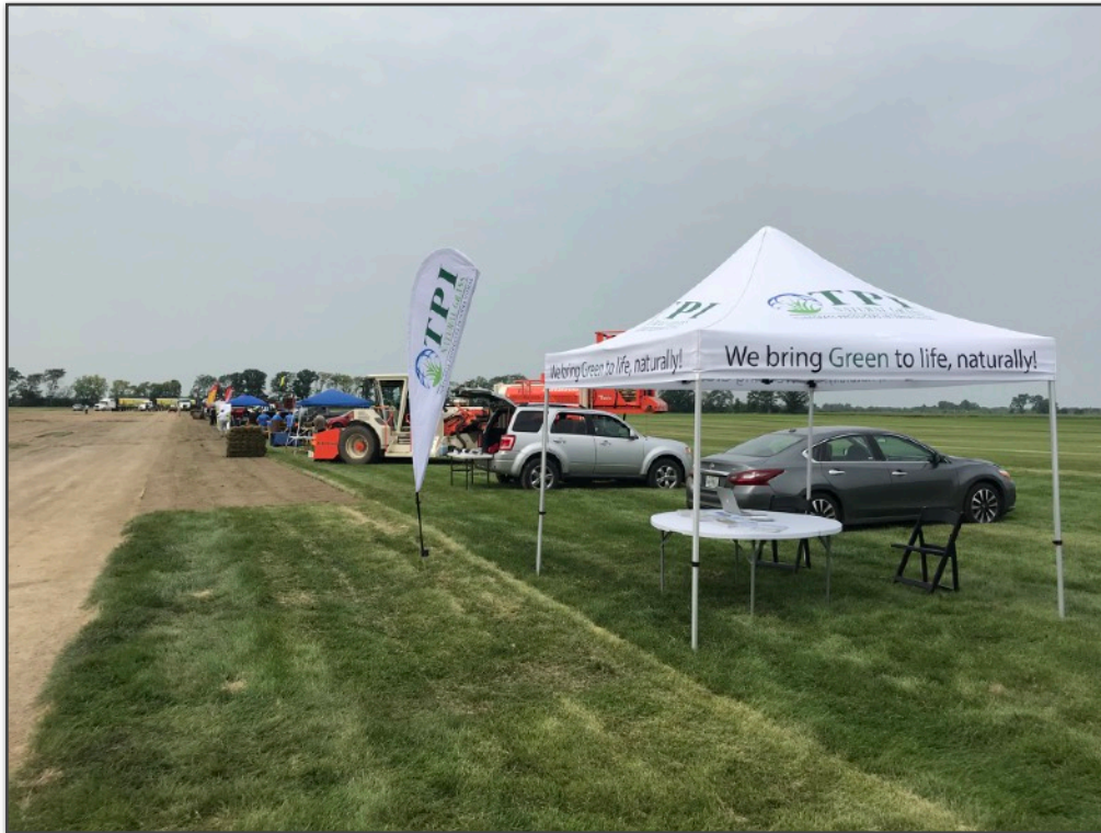
The TPI Booth is set up and ready to talk turfgrass with producers later that day at the Ohio Sod Producers Field Day!