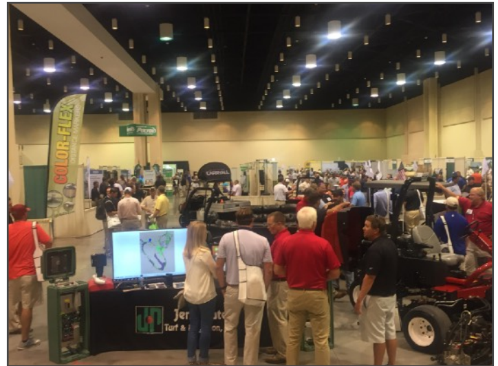
Catch up with TPI on the DSTE Trade Show Floor in Biloxi, MS from Nov 27-29th.

Now in its fourth year, the Expo continues to change and adapt to further meet client's needs across the Southeast. This year's event will host two golf tournaments, a skeet and trap shoot tournament, educational talks, and a trade show. Breakfast, sponsored by Harrells, Syngenta and FMC, will be served on the trade show floor on Wednesday and Thursday morning. The trade show reception, sponsored by Jerry Pate Turf and Irrigation, takes place on Wednesday, from 4:00 – 5:00 p.m. and will include a live band (sponsored by Harrells) during the afternoon! Simplot, Inc., is sponsoring lunch on Wednesday.