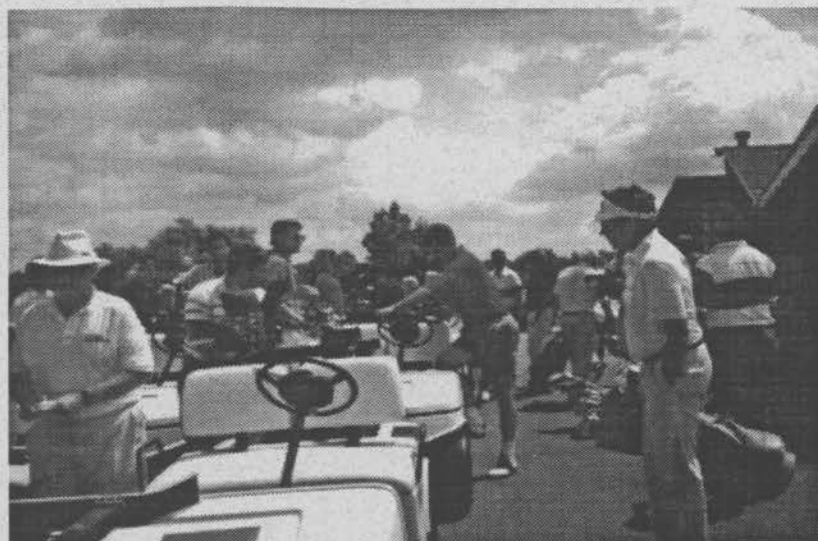
After the July meeting at Winter's Creek, members prepare for work